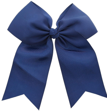
Hair style - with hair bow