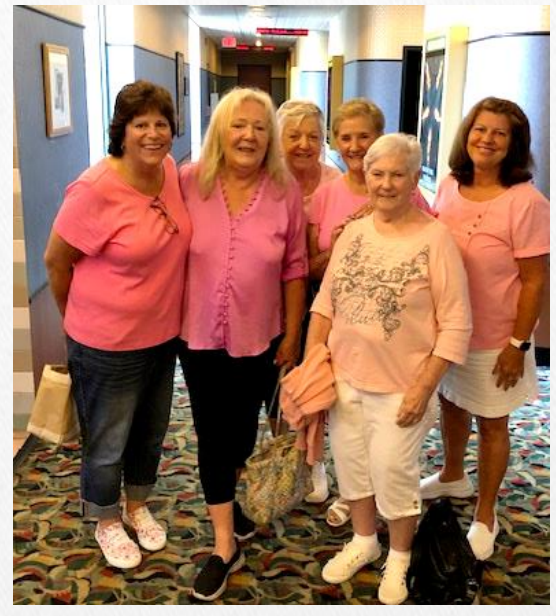
Pink it is! Enjoying the Barbie Movie!