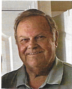
Bill Navel Database