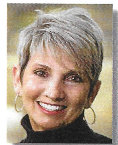
Terrie Rhodes Newsletter/Website