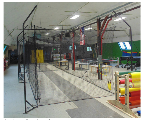
Indoor Batting Cage