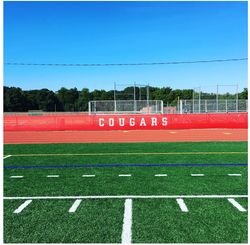
Cherry Hill High School East, NJ