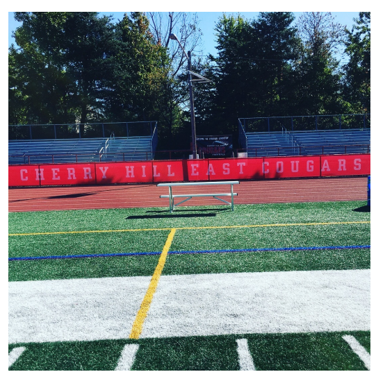
Cherry Hill High School East, NJ