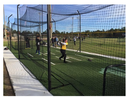
Outdoor Batting Cage

Safety, customization to any size, accessories, and more make the SPECTO net batting cage system the best batting cage net for sale on the market for you and your players.