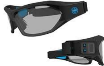
Senaptic Strobe Training Goggles