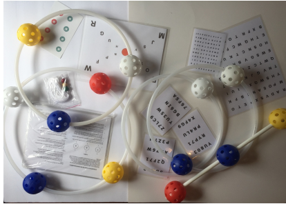
Deluxe Vision Package