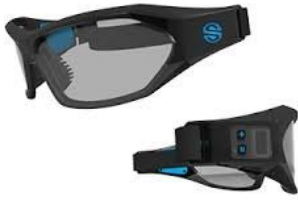
Senaptec Strobe Training Goggles