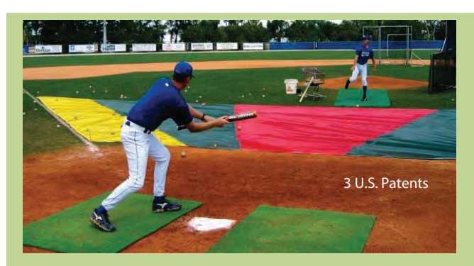
WIDELY ACCEPTED AS TODAY'S BEST BUNT TRAINER.

Available with our exclusive CHROMA-BOND IMPRINTING..