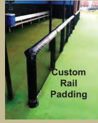
Custom Rail Padding