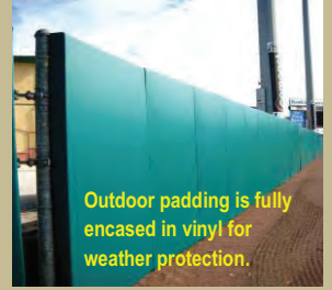
Outdoor padding is fully encased in vinyl for weather protection.

Padding is covered with 18 oz. vinyl in choice of 17 colors. SEE BACK COVER FOR COLOR CHART.