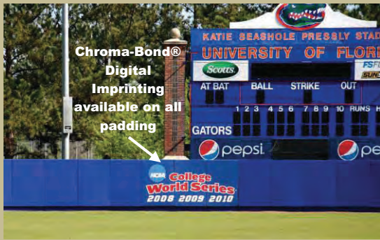
Chroma-Bond® Digital Imprinting available on all padding