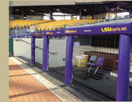
Chroma-Bond® Imprinting – See Page 14.