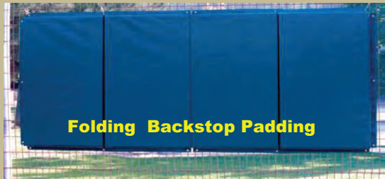
Folding Backstop Padding