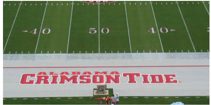
Imprint is 66' x 10' in 2 shades of red plus white on grey protector