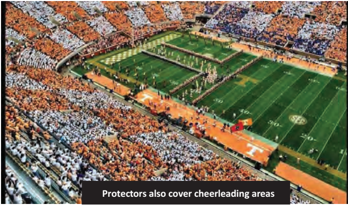
Protectors also cover cheerleading areas