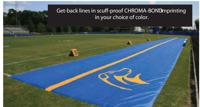
Get-back lines in scuff-proof CHROMA-BOND ® imprinting in your choice of color.