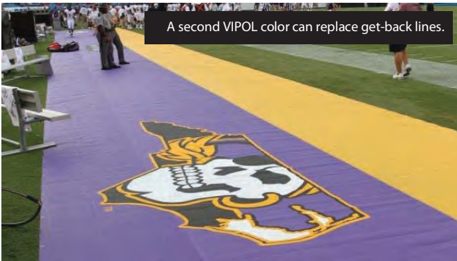
A second VIPOL color can replace get-back lines.

Used by 80+% of NFL and NCAA Div I teams with natural grass fields YET VALUE PRICED FOR SCHOOL BUDGETS