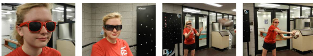
Figure 4: (A): pinhole glasses. (B) strobe glasses. Subject catching ball with strobe (C) or pinholes (D) glasses on.