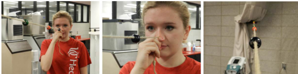
Figure 2: Subject demonstrating Brock's string method. (A) Focus on distant bead. (B) Focus on closest bead. (C) View from subject's perspective.