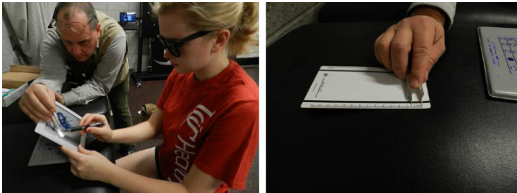
Figure 7: (A) subject pinching wing of Stereo Fly. (B) calipers used to determine the distance.