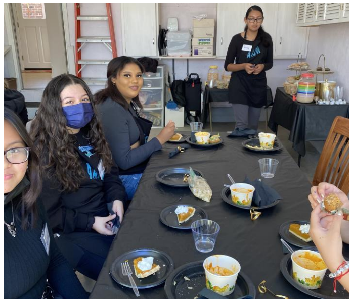
This was a day of learning and doing with lots of laughter thrown in.

The pumpkin carving was loads of messy fun. Because we are not fans of the "violence and mayhem" part of Halloween all pumpkins were carved in a happy and joyful design.