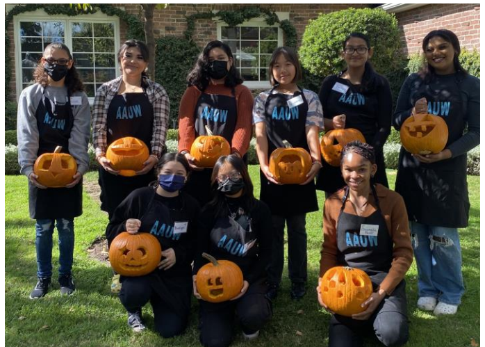
Our next activity is on November 5 th when our girls will attend the "Expanding Your Horizons" conference at U.O.P. This is a full day of hands-on activities which has returned to an in-person format this year. Watch this space for news of that great activity next month.