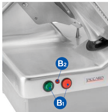
B1. IP67 Rating; Watertight; tamper resistant on/ off buttons B2. Open gauge plate warning light