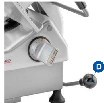
D. Lift leg for quick and easy cleaning under slicer