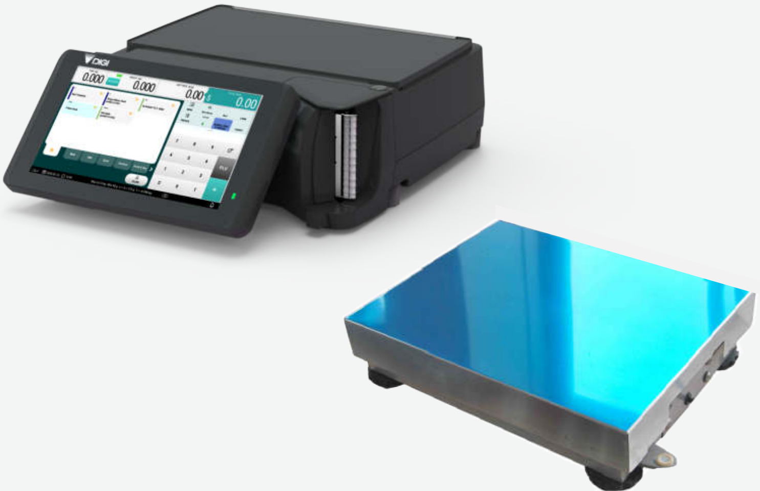
SM-5300X B CON