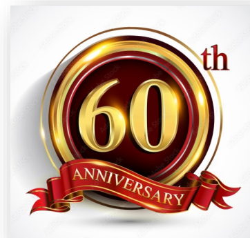
Celebrating the Marlton Woman’s Club 1964—2024