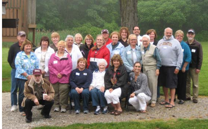
Volunteer Guardianship Picnic 2013

"I've had some outstanding experiences," he said. "I'm comfortable with the thought of death and I think it helps my wards. I never ask about their current situation, unless they