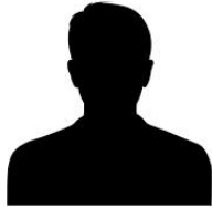
Charles G. Coddling

Born in Granger, Ohio in 1829, he was admitted to the bar in 1860. Coddling became prosecuting attorney in 1865 before being elected probate judge in 1872. He continued to practice law full time after serving two terms as judge.