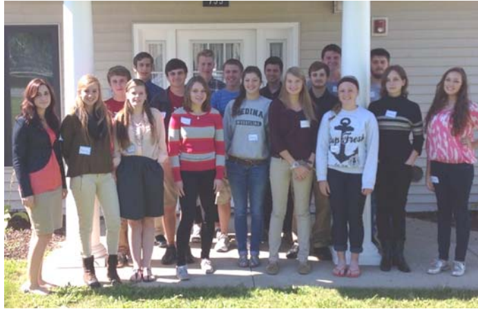
2013-2014 Medina County Teen Court Team