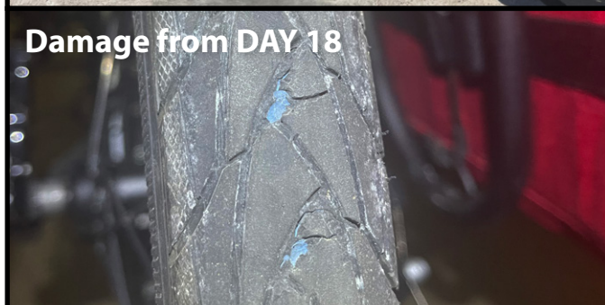
Damage from DAY 18