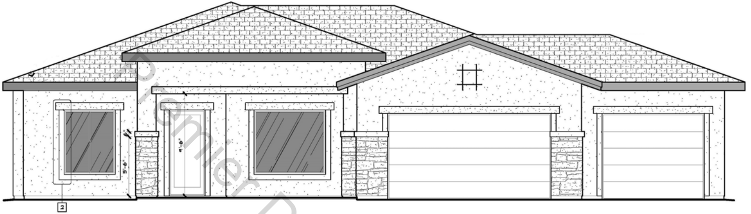
LOT 171 FRONT ELEVATION