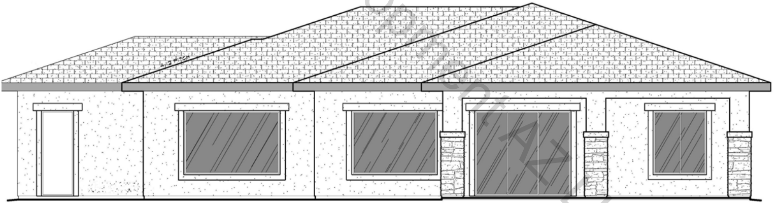
LOT 171 REAR ELEVATION