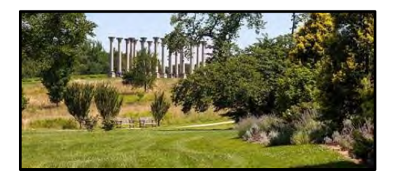
Capital Columns at the National Arboretum

The National Capital Area had its General Spring Meeting at the National Arboretum which featured an Ikebana program and the Awards.