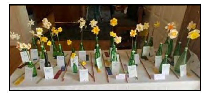
Daffodil entries at a Flower Show