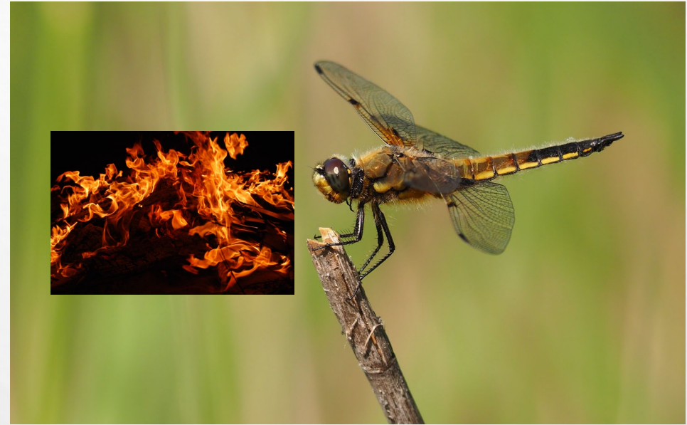
“Do dragonflies breathe fire?” -Kindergartener