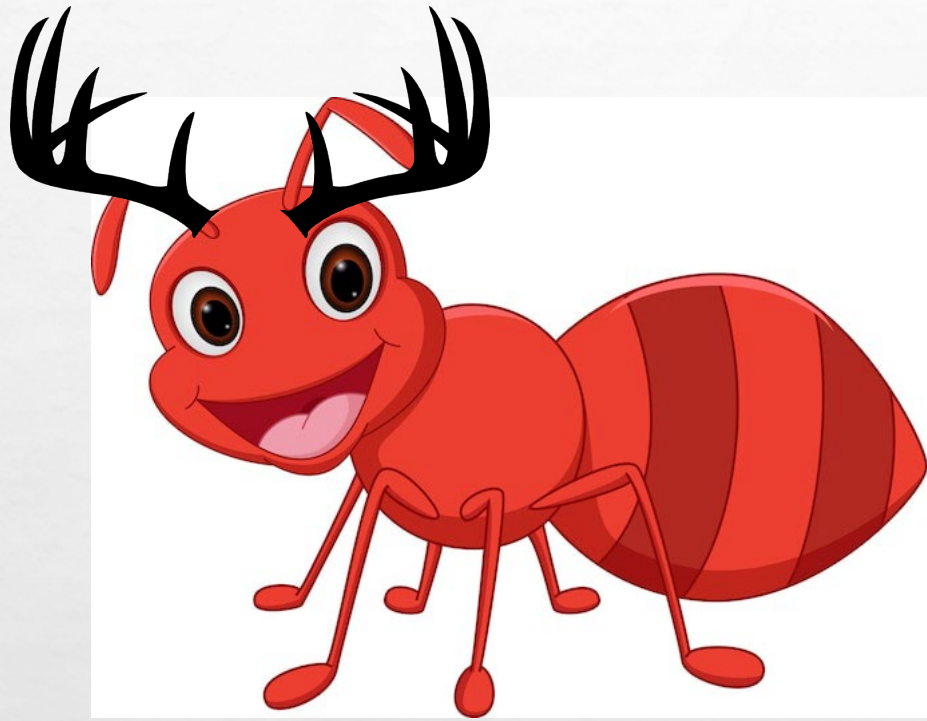
“Do ants have antlers?” -2 nd grader