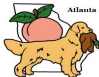
Golden Retriever Club