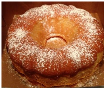
Bundt – 7-Up® Cake

We specialize in food that warms the soul! Our food is a delicious fusion of southern comfort with an east coast flare. We make it easy to feed your guests tasty food through a variety of service options.