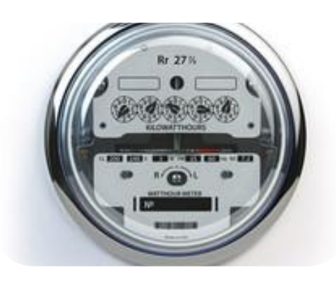
Metering requirements (paid for by landowner)