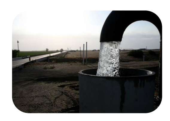
Landowner required annual reporting of monthly extractions