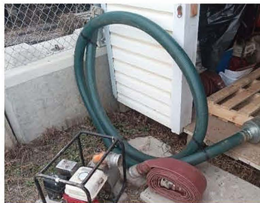
3" TRASH PUMP WITH 250` OF DISCHARGE HOSE