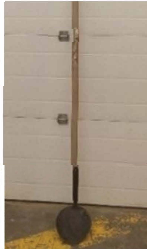
LONG HANDLE SHOVEL

10 FEET LONG, SUMP SAMPLING, ETC $15 / DAY