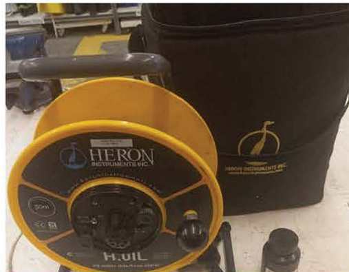
INTERFACE PROBE (OIL & WATER)