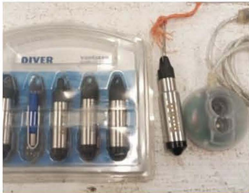
GROUNDWATER DATA LOGGER