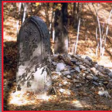
Kings Mountain NMP