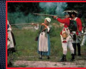
Moore's Creek NB