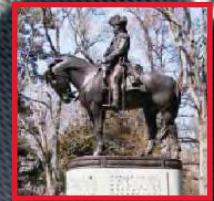
Guilford Courthouse NMP