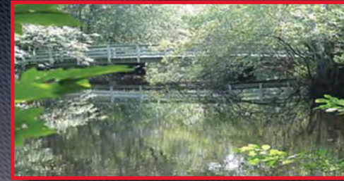
Moore's Creek NB