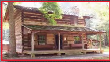
Ninety Six NHS