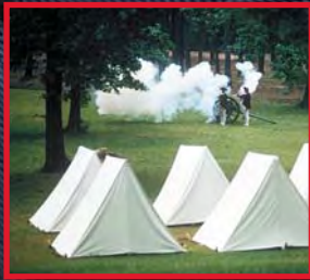
Moore's Creek NB