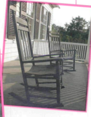
FROM LEFT: the Lichfield Plantation, its Ballroom Suite and the first floor balcony

Overseer's Cottage. Guests can tour the mansion's ornate original rooms which include the White Ballroom and Music Room.