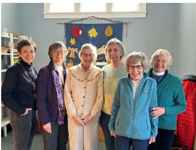
Those providing snacks for the Boys and Girls Club

For several years, several people from St. Paul's have provided wholesome snacks, and the occasional cookie, for 20-30 teenagers who gather after school at the Vergennes Boys and Girls Club. Situated close to the high school and middle school, there are many programs offered at the Club, ranging from STEM oriented gatherings to health initiatives. Many teens attend for the camaraderie or because they are not involved in after-school programs. Some have friends who go regularly. Other teens have no where to go after school, because there is no one is home, home is not safe, or there is no home. Every Wednesday, parishioners deliver snacks as the doors open at 2pm.