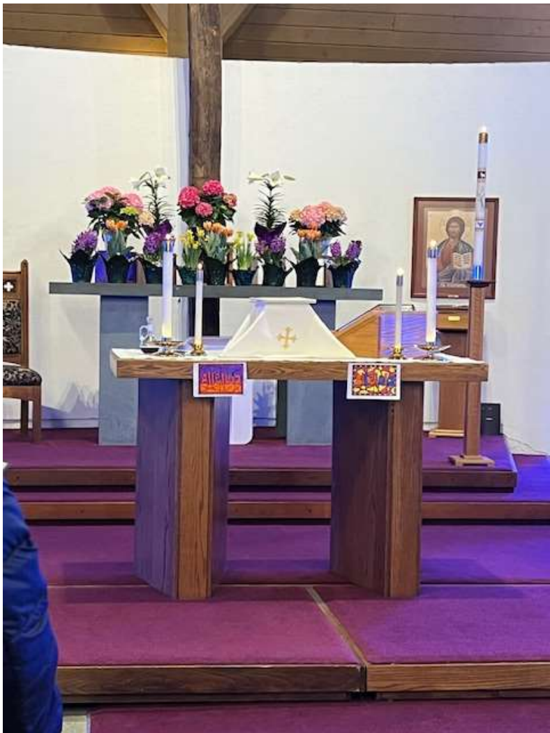
Easter Sunday at All Saints