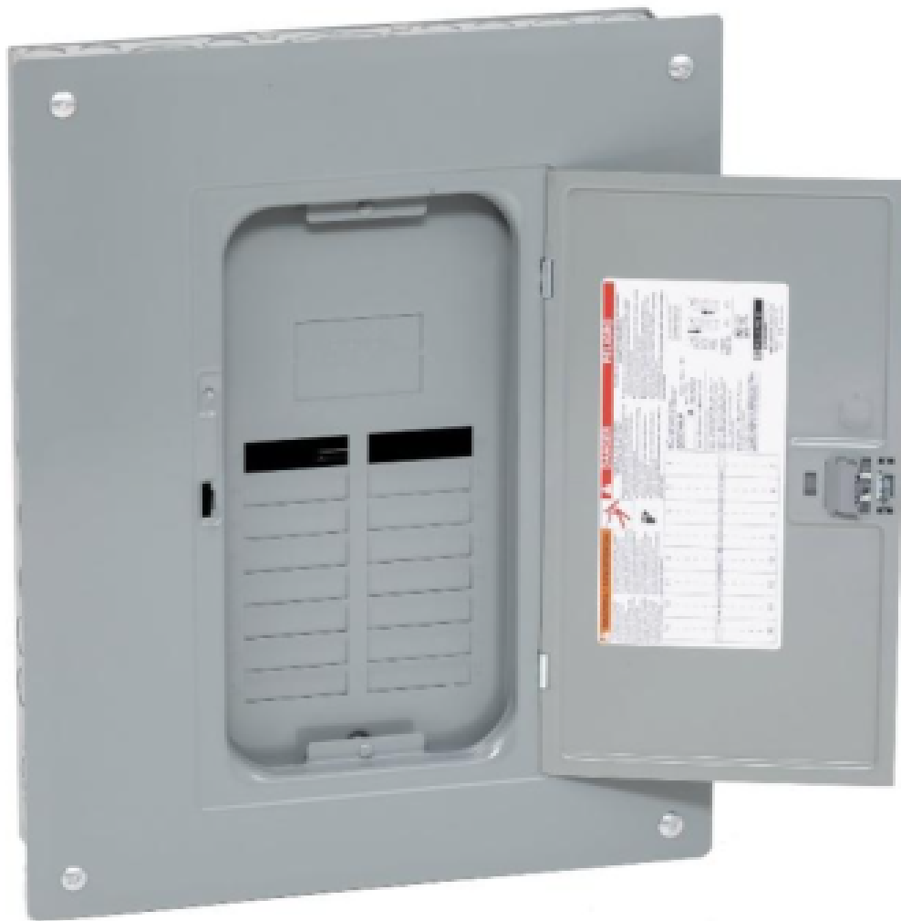
Recalled Indoor Load Center (Catalog Number QOC16UF)