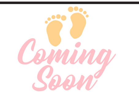
Little Movers & Shakers Parent / Child Play Group For ages 0-2

Wednesday, October 11th, 11am-12pm FREE EVENT | Registration Required Visit ujcvp.org to sign up! Questions? Email carmela@ujcvp.org