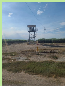
Security to ensure that people do not run away from their designated field.