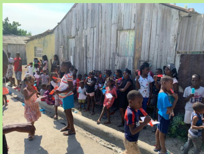
Treating the kids with popsicles and blessing the local market.

The residents at the Matthew 25 House are enjoying the fresh cool breeze that January has brought. They are thankful for their windows that Harvest Bible Church blessed them with last year, so they can close up the house when needed.