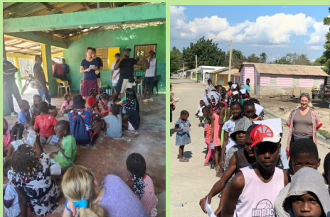
Sharing the store of Noah's obedience and pointing to the Christ for our eternal hope!