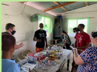
Medical Clinics were provided to people in areas where they had not seen doctors in over two years!