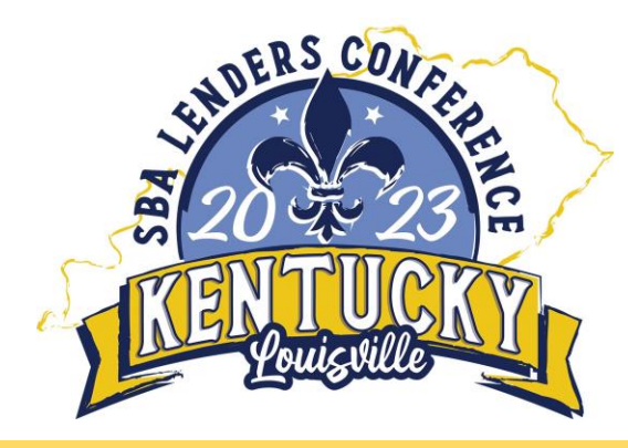
Exhibit Hall Events – Win Prizes!

Visit Exhibitors throughout the conference during the Welcome Reception, breakfasts, breaks, lunch, and happy hour to earn points in our Event Game & win prizes during our closing session!