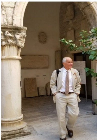
Diocletian’s Palace Split, Croatia

Although I have never taken advantage of opportunities to receive formal art instruction (so far), I still could never say I was “self-