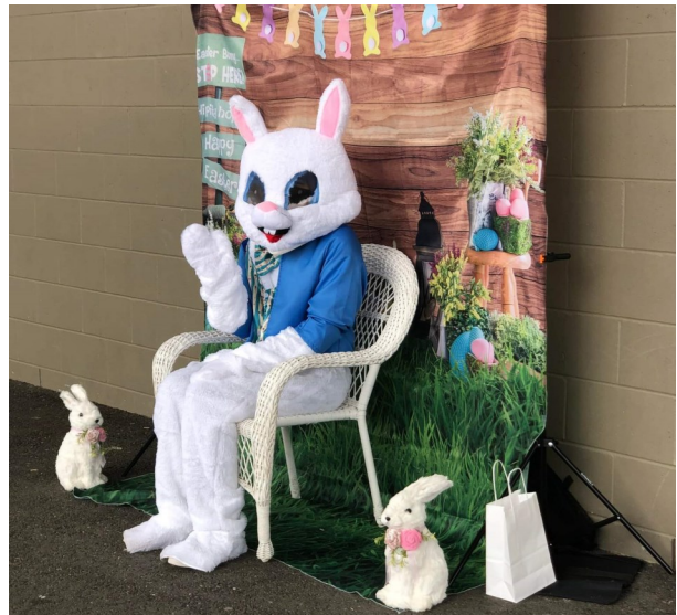
Easter Bunny attends the Spring Fair 2022