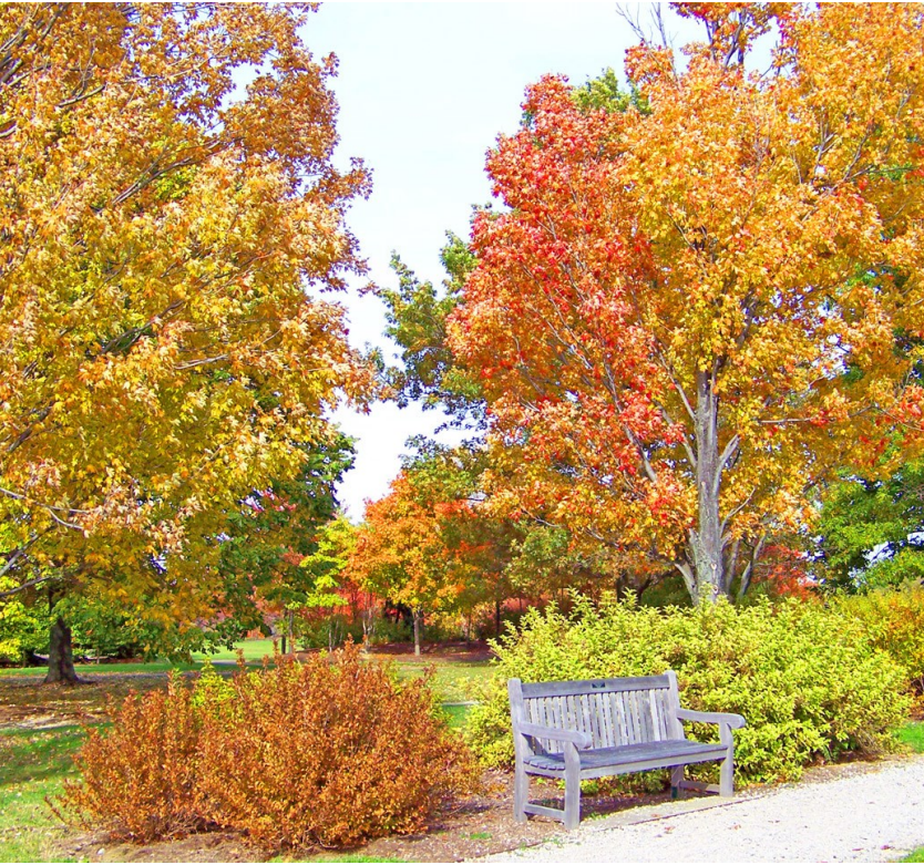
Columbia Valley Parks and Recreation Dist.