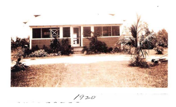
c.1920 Caves Residence in its original location