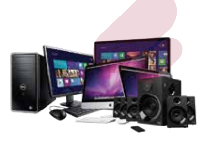
IT & Accessories