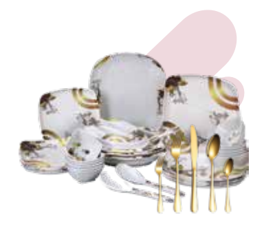
Crockery & Cutlery