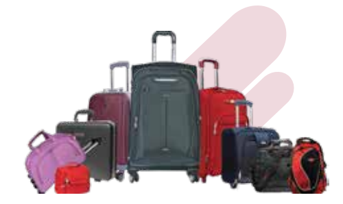
Bags & Luggage