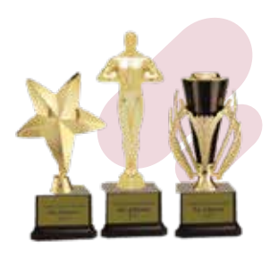
Awards & Trophies