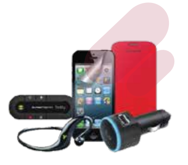
Mobiles & Accessories

Crimson is a one- stop shop for all your gifting requirements