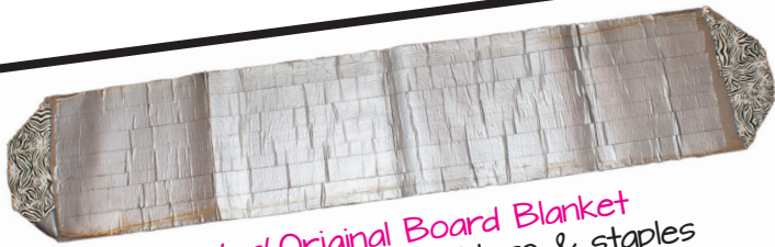
The actual Original Board Blanket Yoga mat, duct tape, Velcro & staples