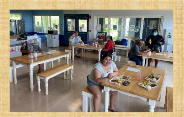
Lunch is served!