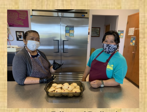
Felina and Dedicacion