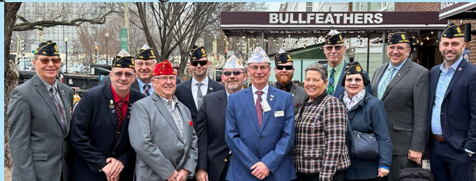
Michigan Legion Department of Michigan's delegation in Washington DC to meet with Lawmakers

A delegation from the Michigan American Legion traveled to Washington, DC, to meet with our national representatives and their staff members one-on-one. The Michigan Legionnaires