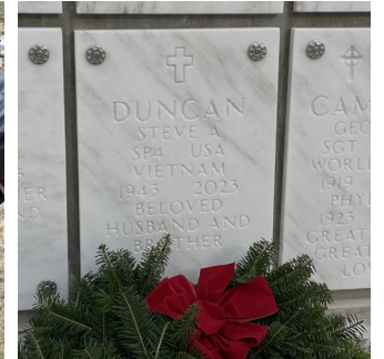
The wreath on the columbarium for past member Steve Duncan

2024 Membership: February 2 nd Goal = 54,119 Current Total: 48,308-89.26%