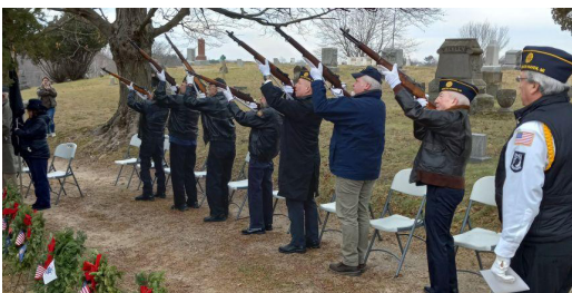
Post 49 and 106 Honor Guards Salute at Wreaths Across America