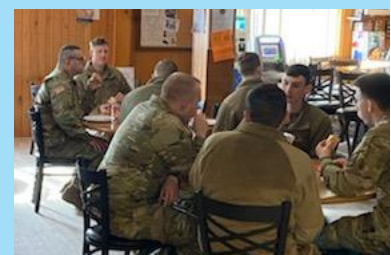
The National Guard of Grand ledge sit down at the post for a Saturday Lunch during drill weekends