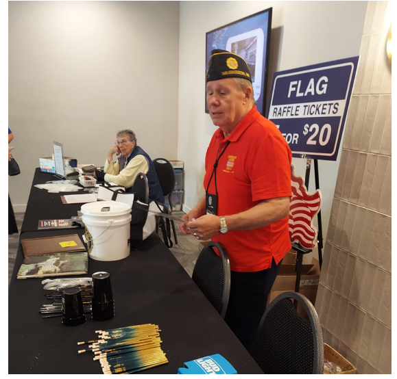
Thanks to the Convention Committee for a fun Fall Conference.