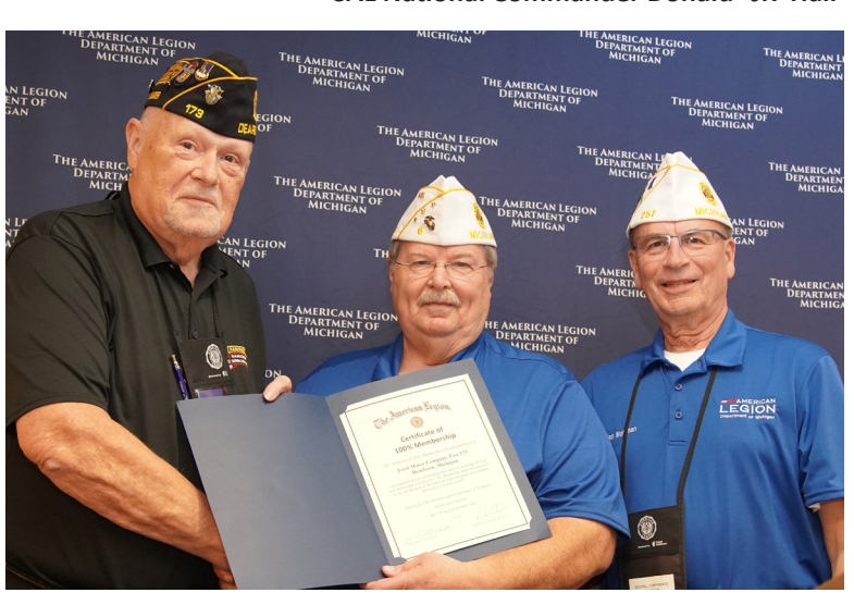
Ford Motor Company Post 173 first to achieve 100% Membership.