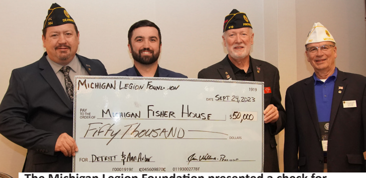
The Michigan Legion Foundation presented a check for $50,000 to the Fisher House.