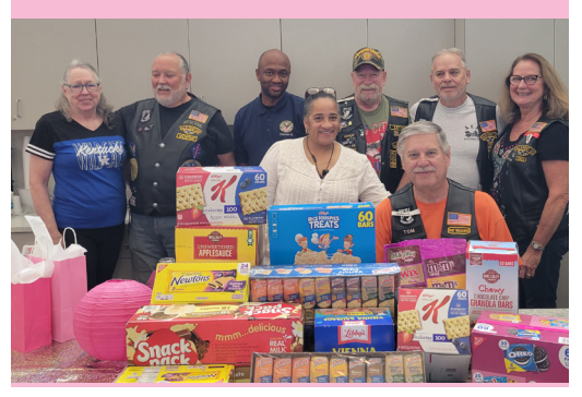
Post 159 in Mackinaw City completed major upgrades to their post inside and out!

Snack foods that the Livonia American Legion Post 32 Riders donated to the VA Outpatient Clinic in Canton.