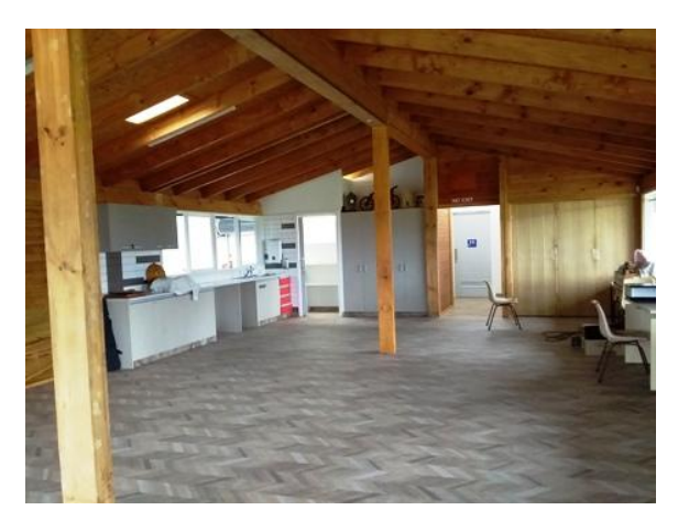
The clubroom looking towards the kitchen, office and toilet facilities.

It is possible that we will be able to make our final move in mid February.