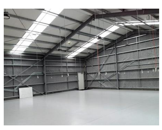
A portion of the new workshop.