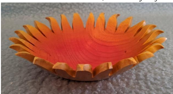
Covid No 31: My "Sunbowl". Ash bowl approx 185mm diam 50mm deep. Airbrushed with wood dyes & finished with my favourite Livos oil."