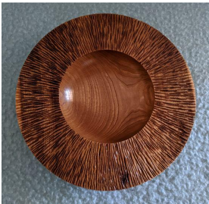
Covid No 25: Elm bowl (left) with textured rim approx 210mm diam 35mm deep.

No.21 blackwood crotch bowl (right) approx 290 diam 90mm tall Covid No 23: Small goblet, unknown wood approx 60mm diam 90mm tall.