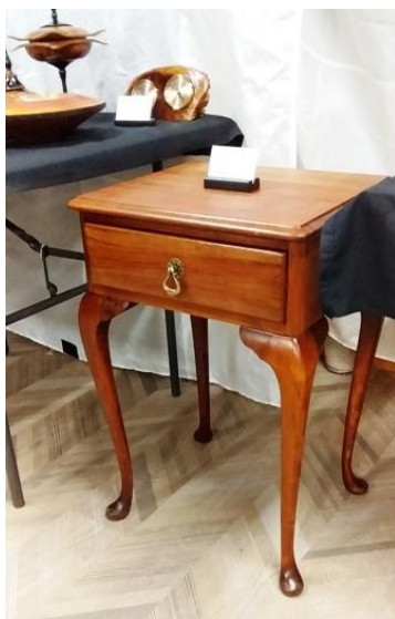
Don's side table