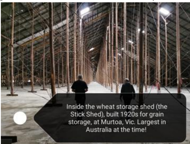
Inside the wheat storage shed (the Stick Shed), built 1920s for grain storage, at Murtoa, Vic. Largest in Australia at the time!