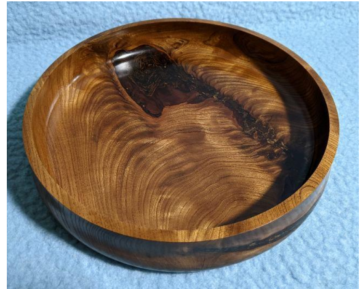
"Shallow Blackwood bowl(below) approx 255mm diam 40mm high."