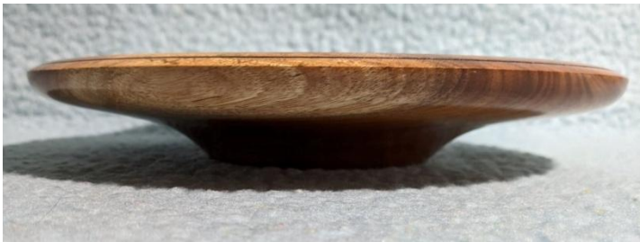
"Kauri bowl with pyro'd rim approx 295mm diam 40mm deep. The last piece of kauri left over from making my rocking horse a few years ago."