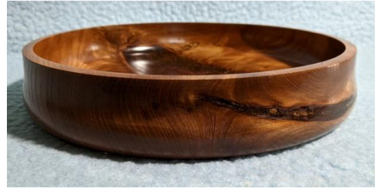
"Elm crotchwood bowl (right) with great grain & a significant bark inclusion. Much trepidation & significant amounts of coffee grounds, CA glue & duct tape were consumed in its making. Approx 280mm diam 55mm tall."