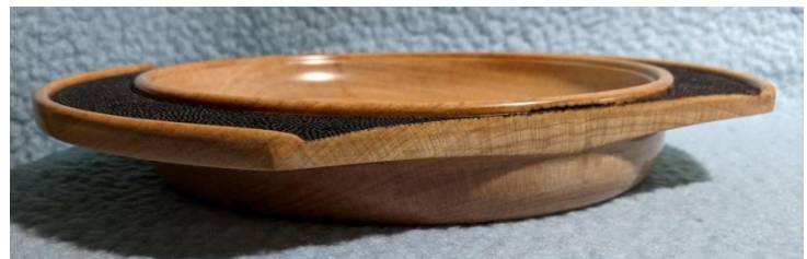
"Elm semi-enclosed bowl. Some nice grain and chatoyance in this piece. Approx 240mm diam 50mm tall."