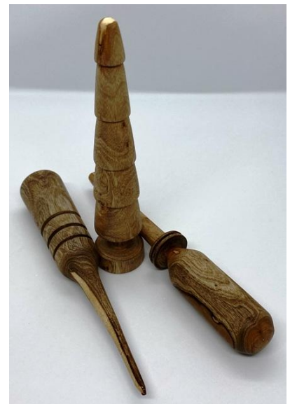
Pear tree wands.