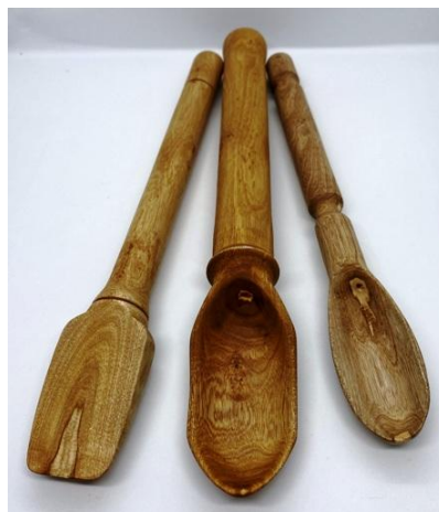
Pear kitchen tools.