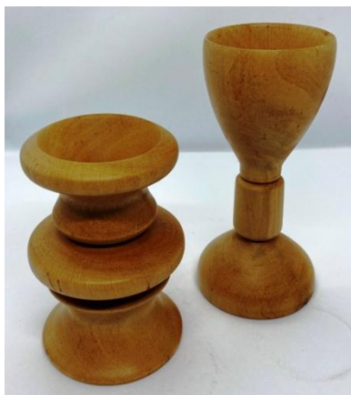
Gum goblets and vase.