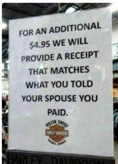
Written for Harley Davidson but could easily apply to your new woodworking machine.