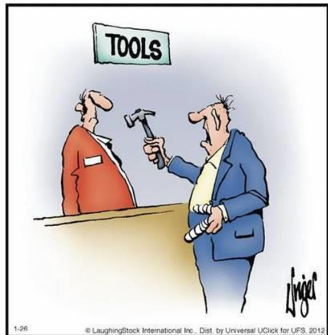
"This hammer keeps hitting two inches to the left."