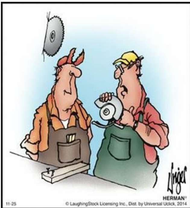
"See that?! I forgot to tighten the nut."